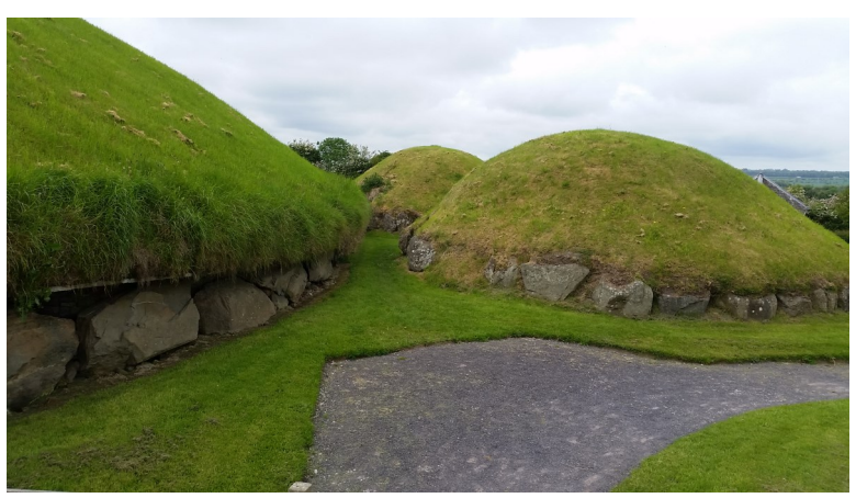
Knowth passage tombs

We travel to Dublin Airport for international flights and transfers arriving 9am for flight departures from NOON onwards.