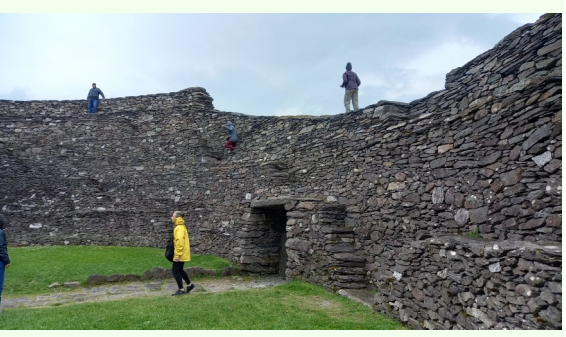
Cahergill stone ringfort