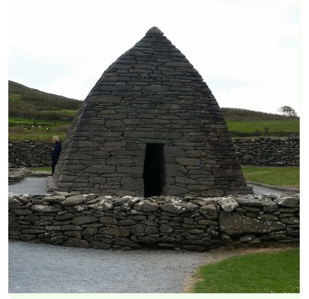
Gallarus Oratory near Dingle