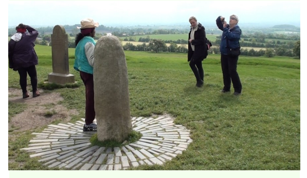
The Lia Fail on the Hill of Tara