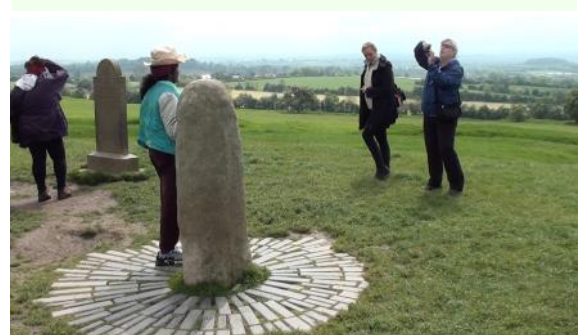
The Lia Fail on the Hill of Tara