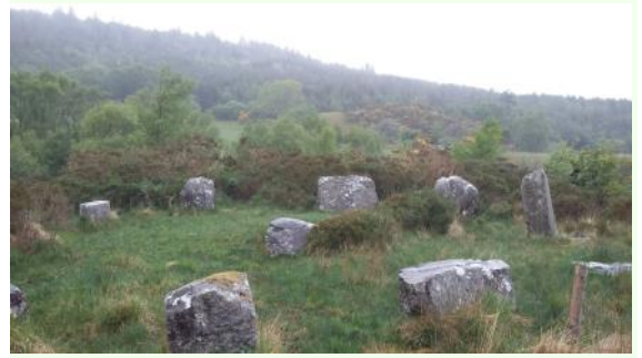
Stone circle of Gurteen