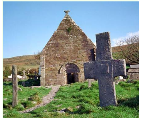
Kilmalkedar Church in Dingle